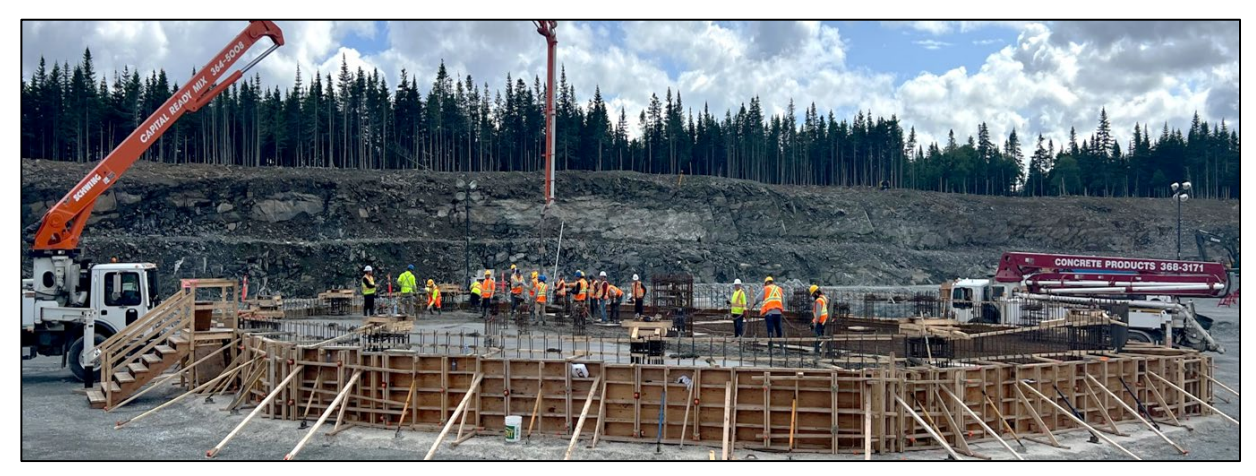
Figure 3: Concrete Slab and Formwork, SAG/Ball Mill (top left), Transformer Installation (top right), Tailings Thickener Concrete Pour (bottom). All July 2023