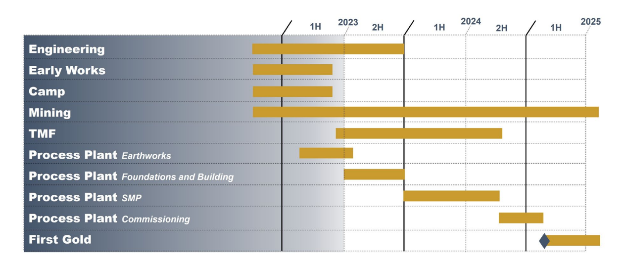
Figure 8: Valentine Gold Project Construction Schedule, July 2023

the second half of 2024. The project remains on schedule to achieve mill commissioning in Q4 2024 and first gold in Q1 2025.