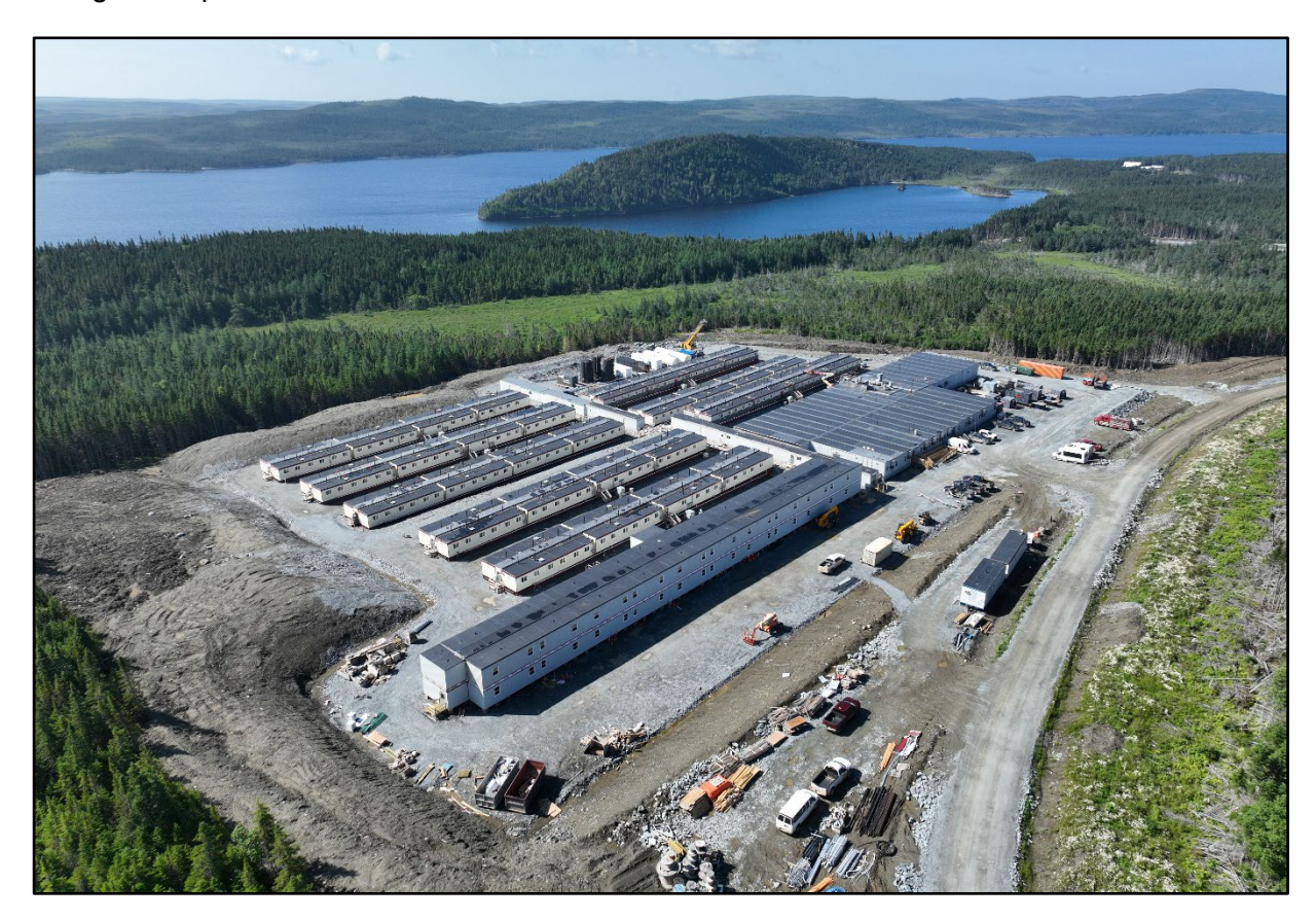
Figure 6: Permanent Camp showing installation of Phase 2 Dorms), July 2023

critical mine deliveries will be scheduled outside the spring season and a light vehicle traffic management plan initiated.