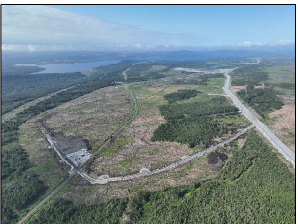
Figure 5: Construction of the Toe Road for the Tailings Management Facility. Advancement of the construction toeroad from the southwest (left) and northeast (right) simultaneously, July 2023