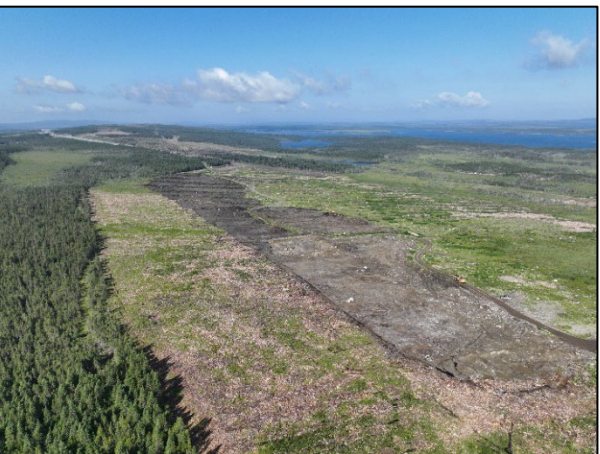
Figure 4: Mining at the Leprechaun Pit (left, looking NE) and Overburden Removal at Marathon Pit (right, looking SW), July 2023

Mining during the Project's construction period is ongoing to generate rock for haul roads, pads and the TMF. As of June 30 2023, 2.1 Mtonnes of waste rock construction material and 235 ktonnes of overburden material had been moved, consistent with forecast targets. A second mining shift commenced at the end of May, and during June 2023 the Project average daily mining volumes in excess of 16 ktonnes per day, adequately compensating for lower productivity at the beginning of the quarter attributable to the spring thaw. Overall, mining productivity and equipment