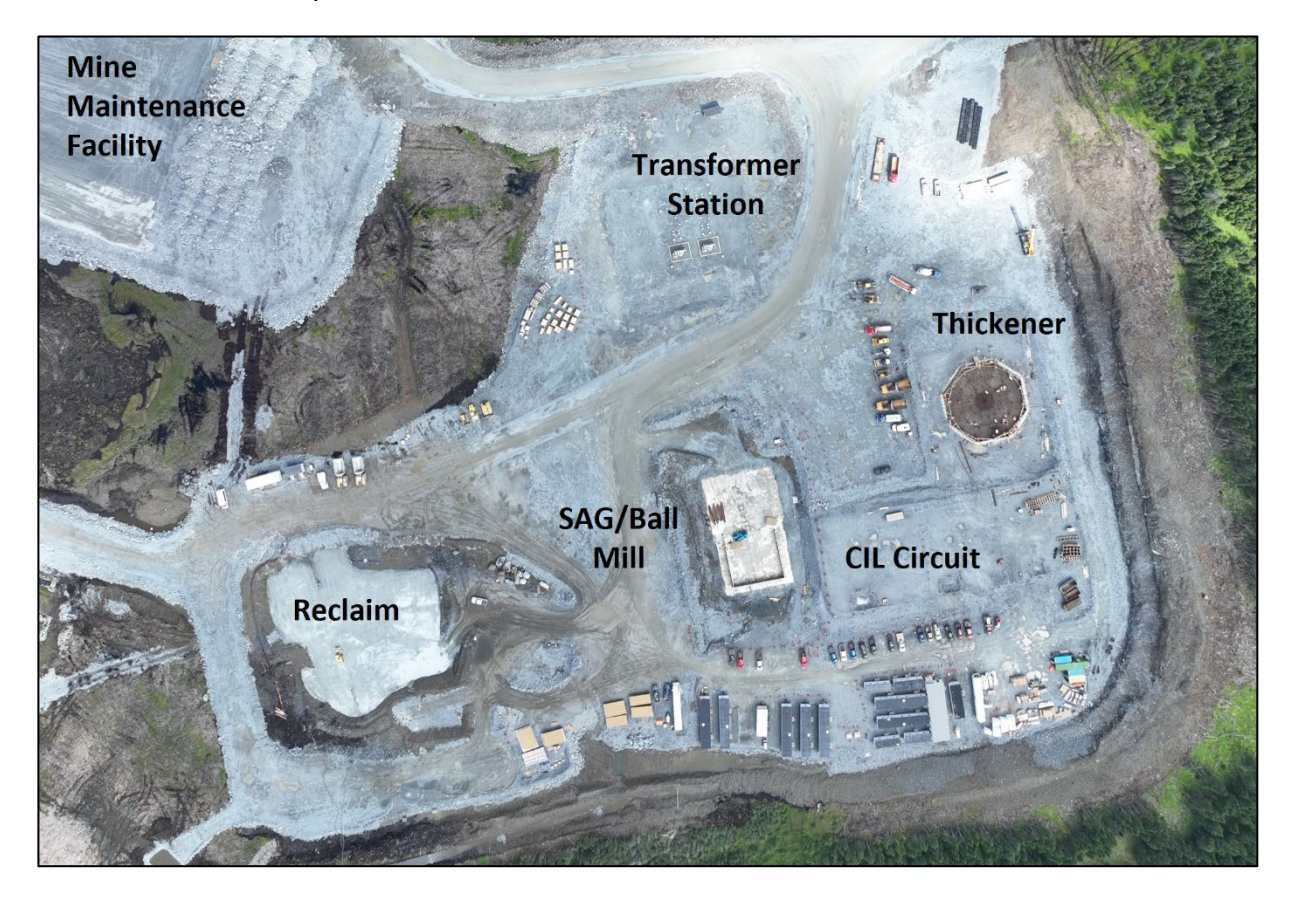
Figure 2: Overview of Process Plant Site. July 2023

Process Plant Site Preparation and Foundations