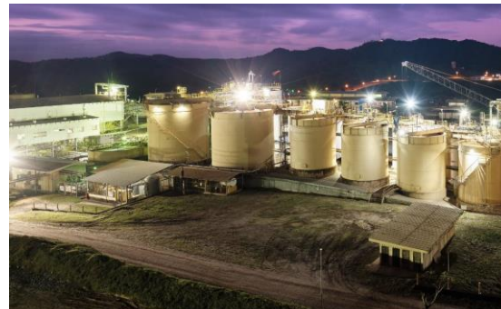
La Libertad Mill