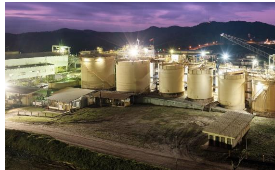
La Libertad Mill