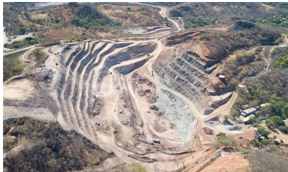
El Limon Mine